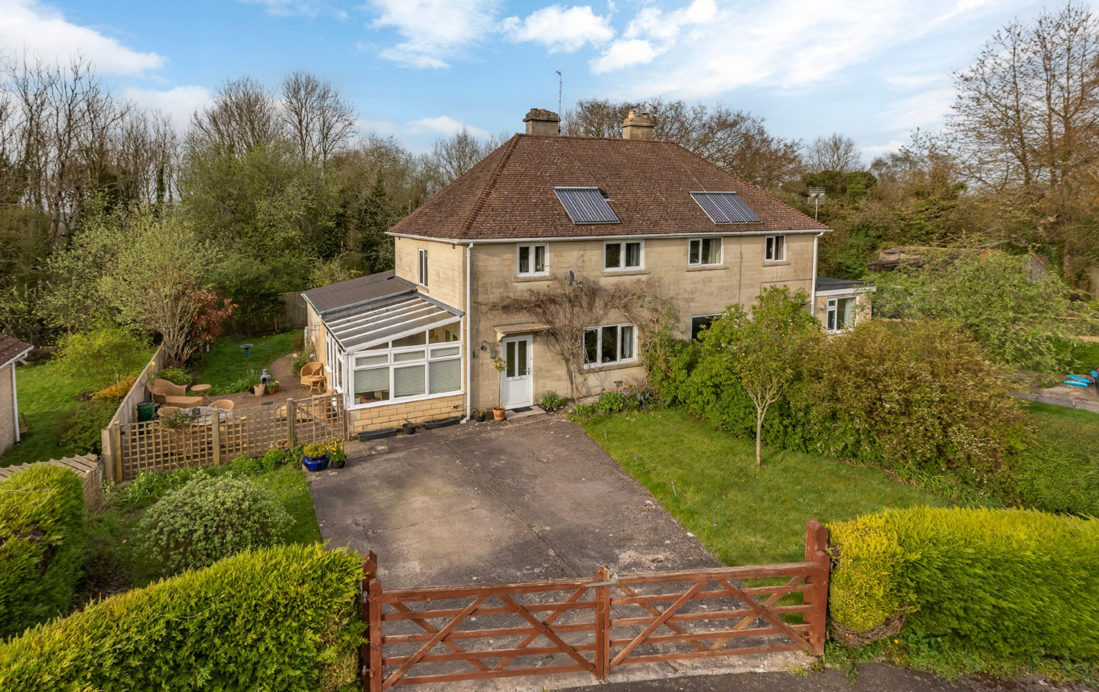
11 FARLEIGH RISE Monkton Farleigh