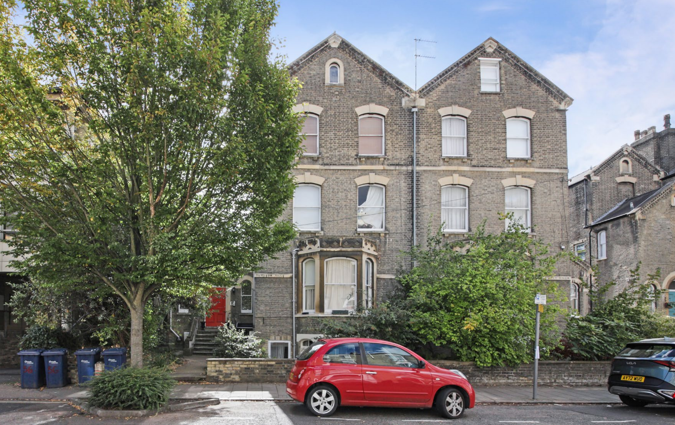
FLAT 4, 56 BATEMAN STREET Cambridge