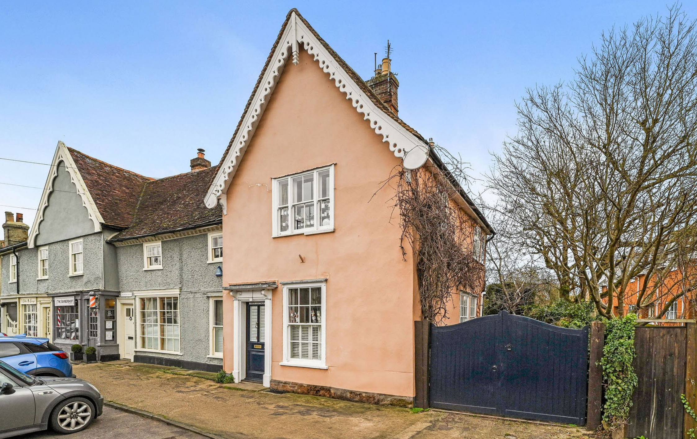
FREER COTTAGE Long Melford, Suffolk