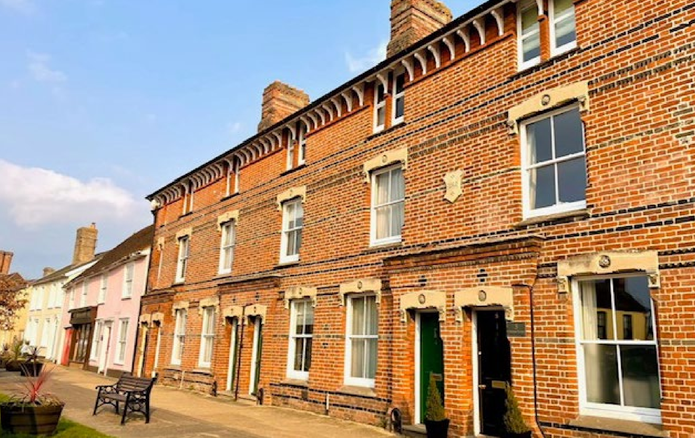
5 CHESTNUT TERRACE Long Melford, Suffolk