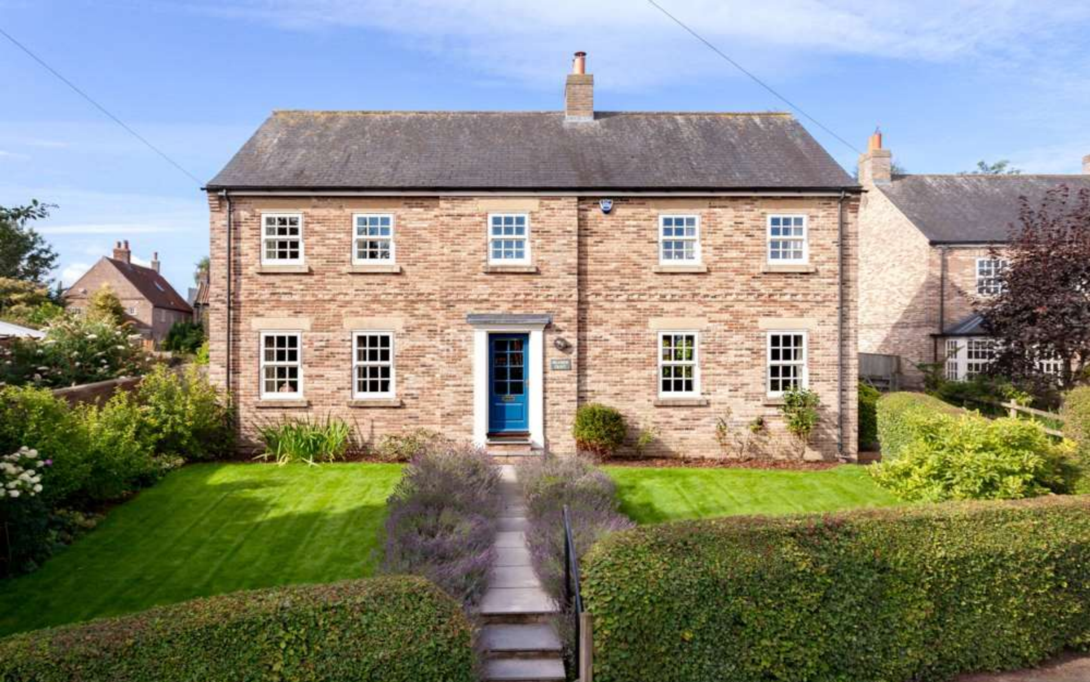
MEADOWCROFT, BACK LANE, TOLLERTON, YORK, YO61 1PZ £800,000