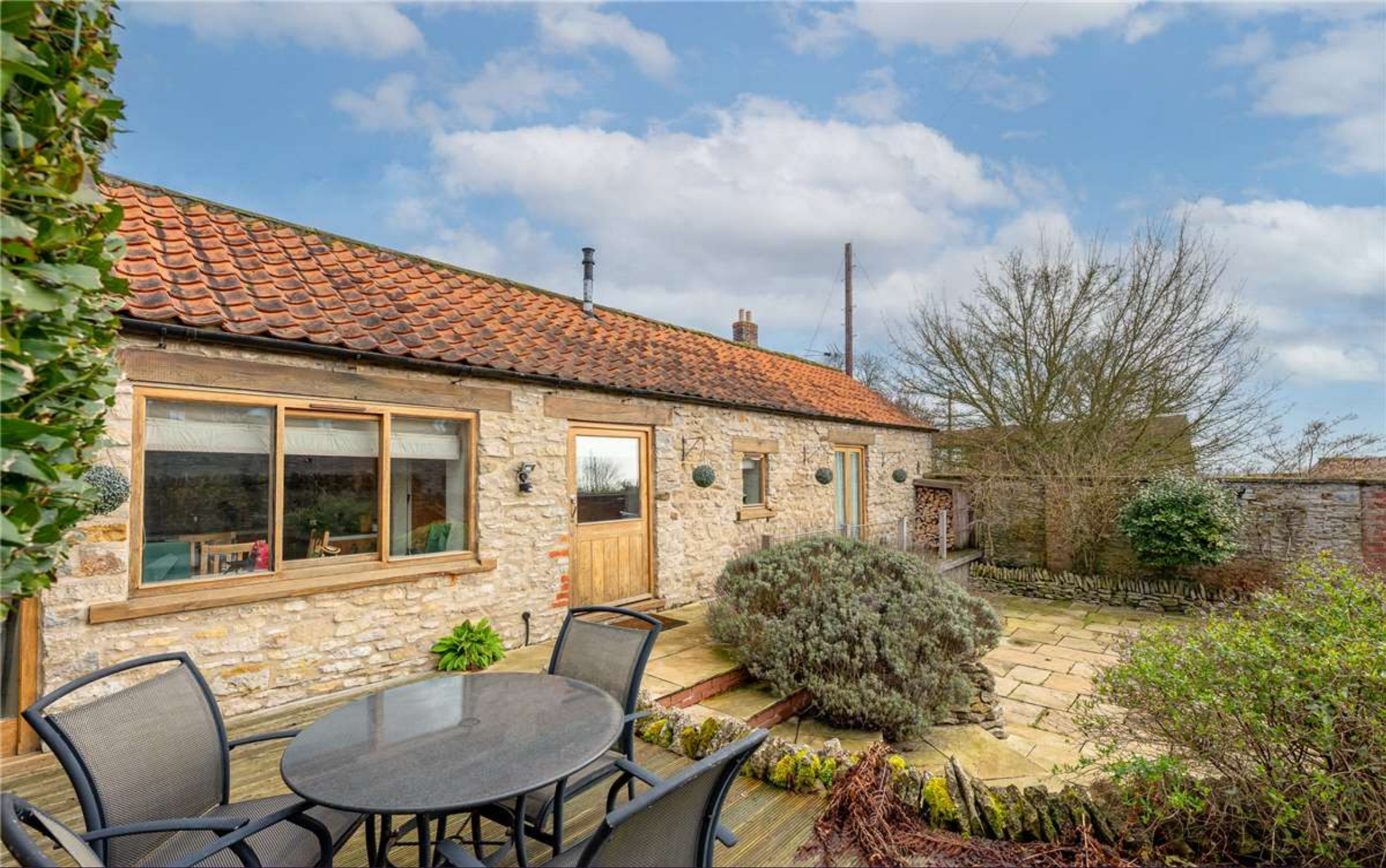
NORTH BARN, POCKLEY, YORK £450,000