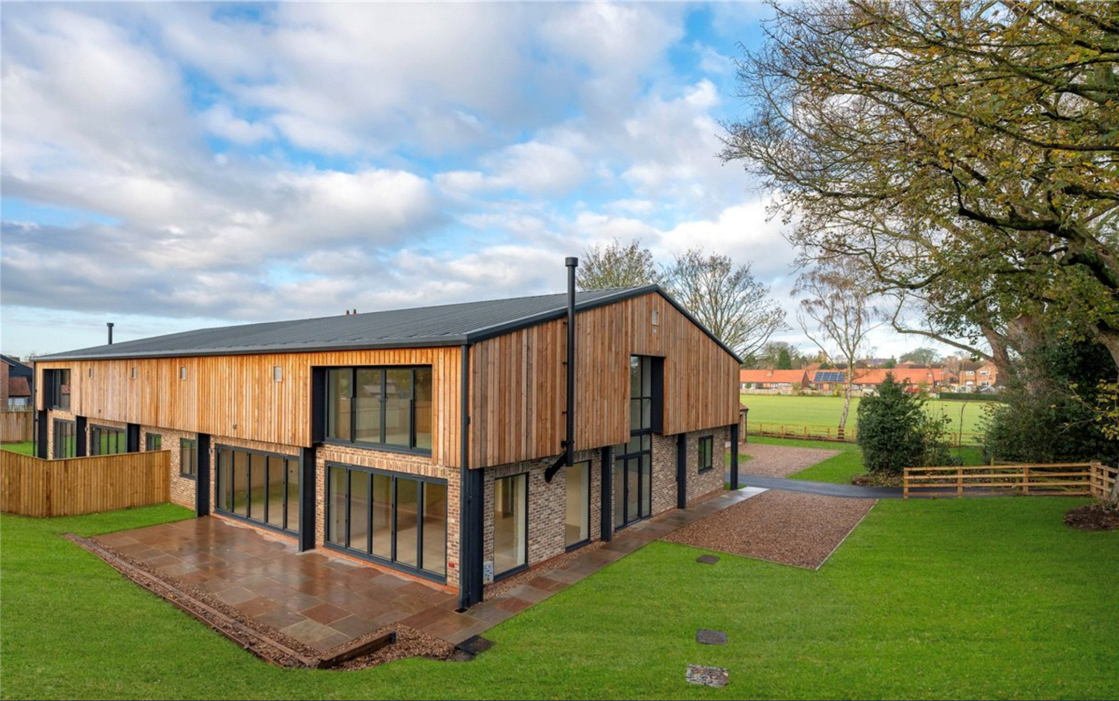
CRAVEN COURT, HELPERBY, YO61 £850,000