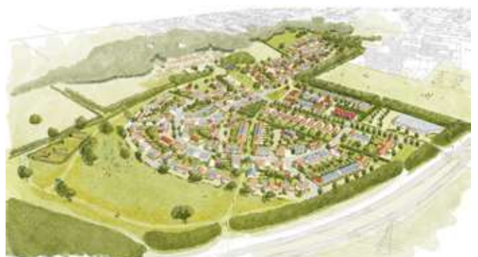
Land north of Cambridge Road, Linton