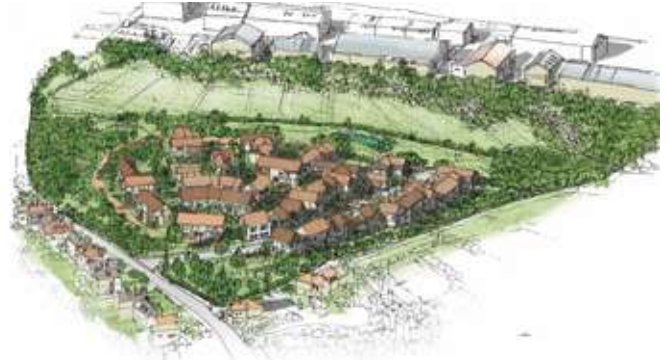
Land at Earls Colne, Essex

Key projects our team has been involved with: