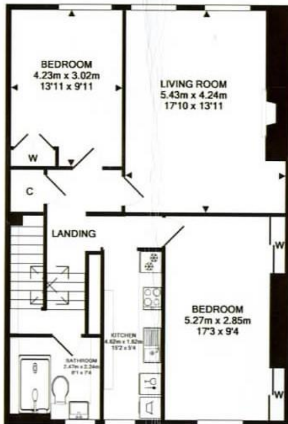
TOP FLOOR FLAT, 12 CAMDEN CRESCENT, BATH TOTAL APPROX. FLOOR AREA 77.5 SQ.M. (834 SQ.FT.)

Whilst every attempt has been made to ensure the accuracy of the floor plan contained here, measurements of doors, windows, rooms and any other items are approximate and no responsibility is taken for any error, omission, or mis-statement. This plan is for illustrative purposes only and should be used as such by any prospective purchaser. The services, systems and appliances shown have not been tested and no guarantee as to their operability or efficiency can be given. Made with Mettix ©2016