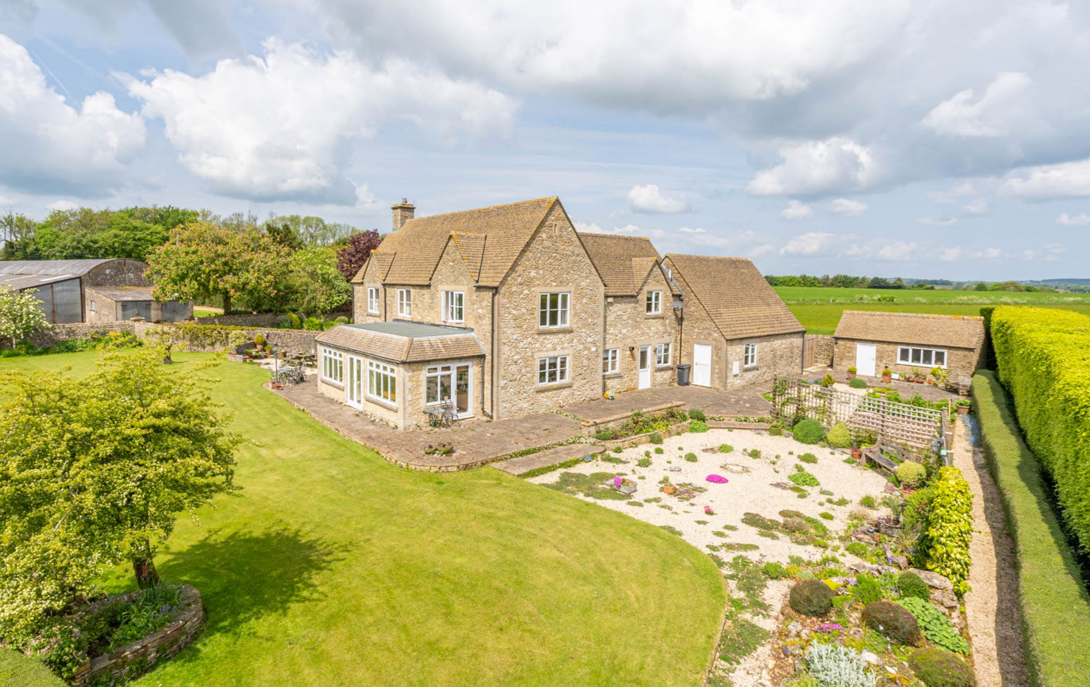
THE LODGE, HAZLECOTE FARM Kingscote