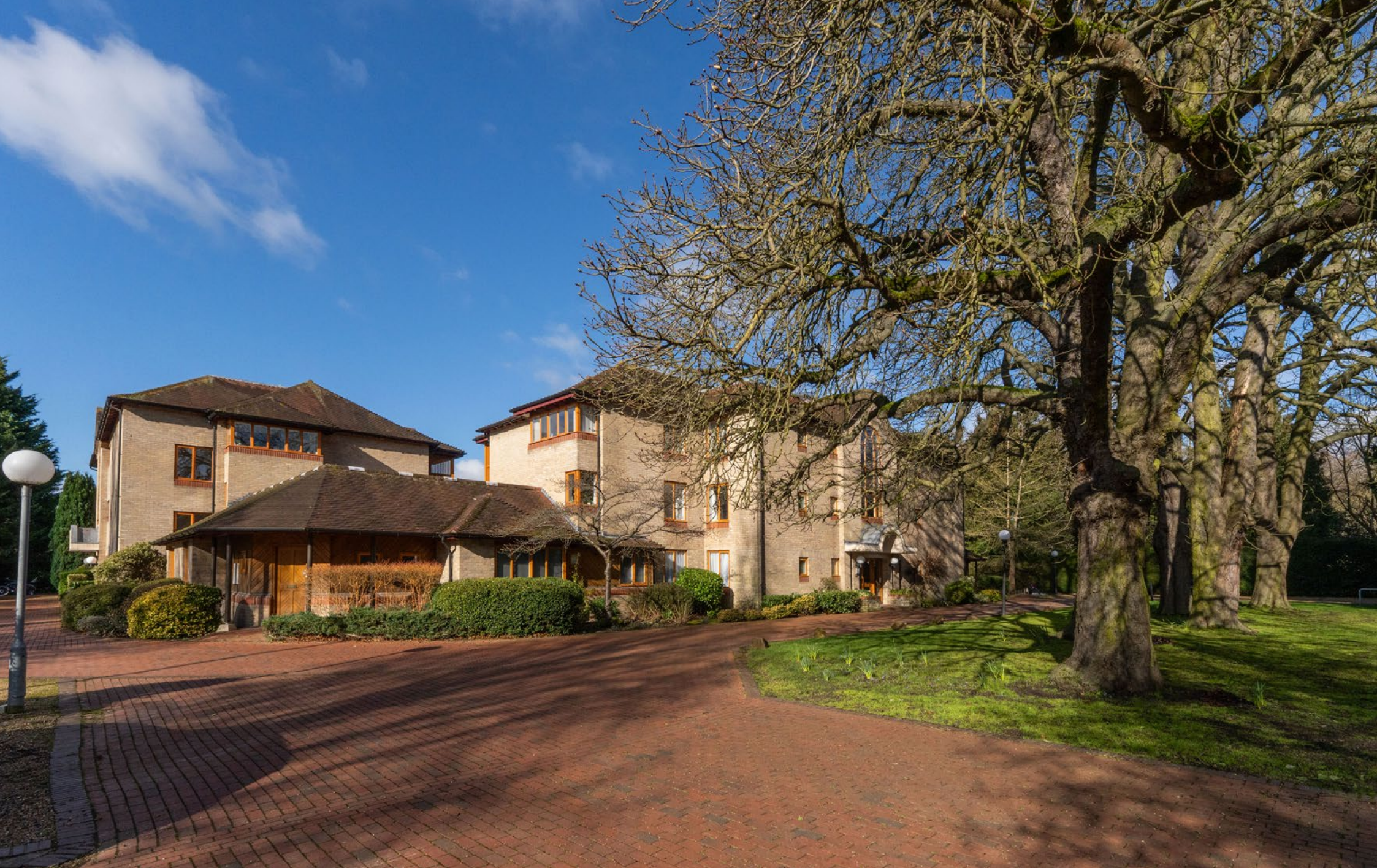
BROOKLANDS COURT Cambridge