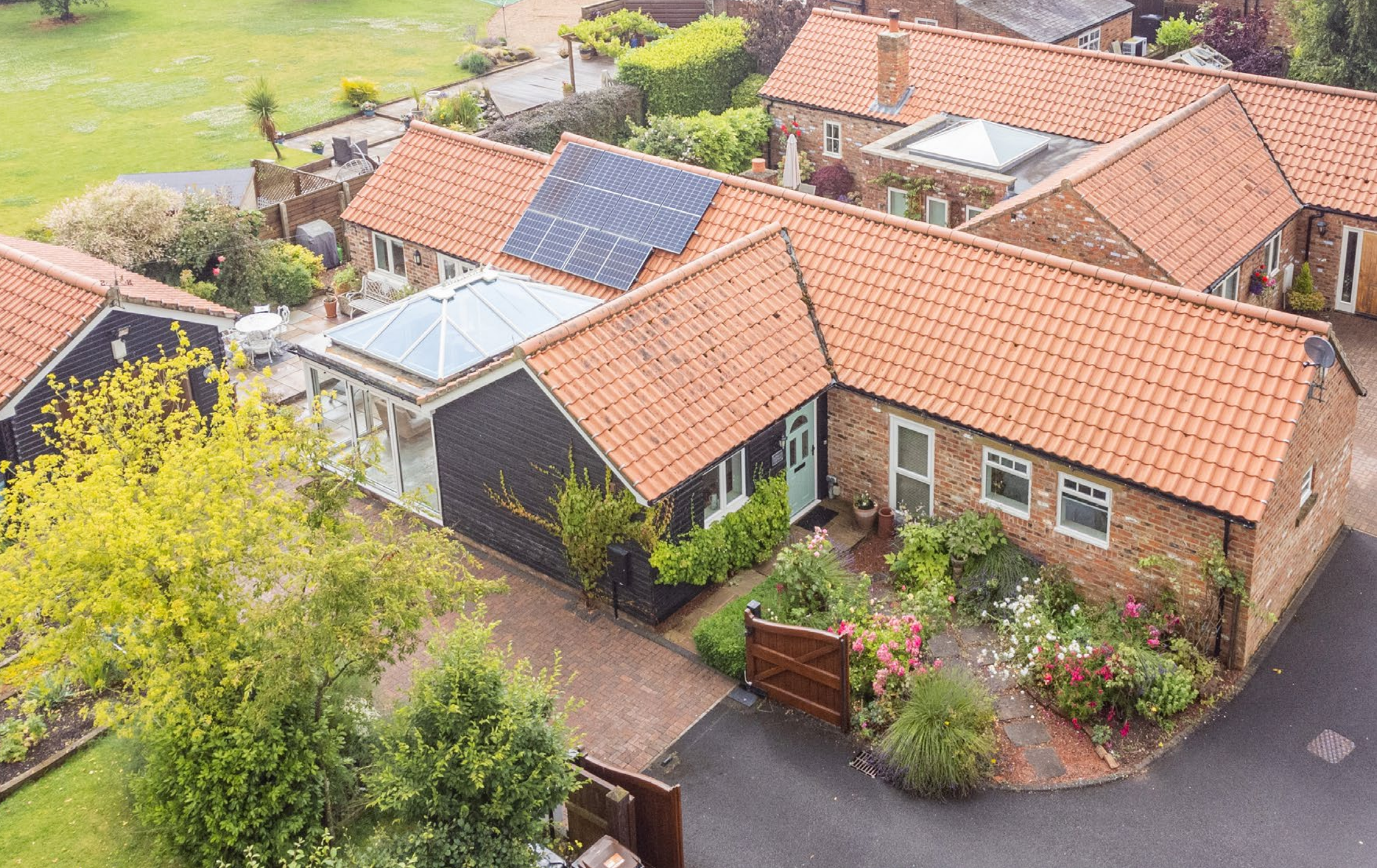
SHETLAND COTTAGE Moor Monkton