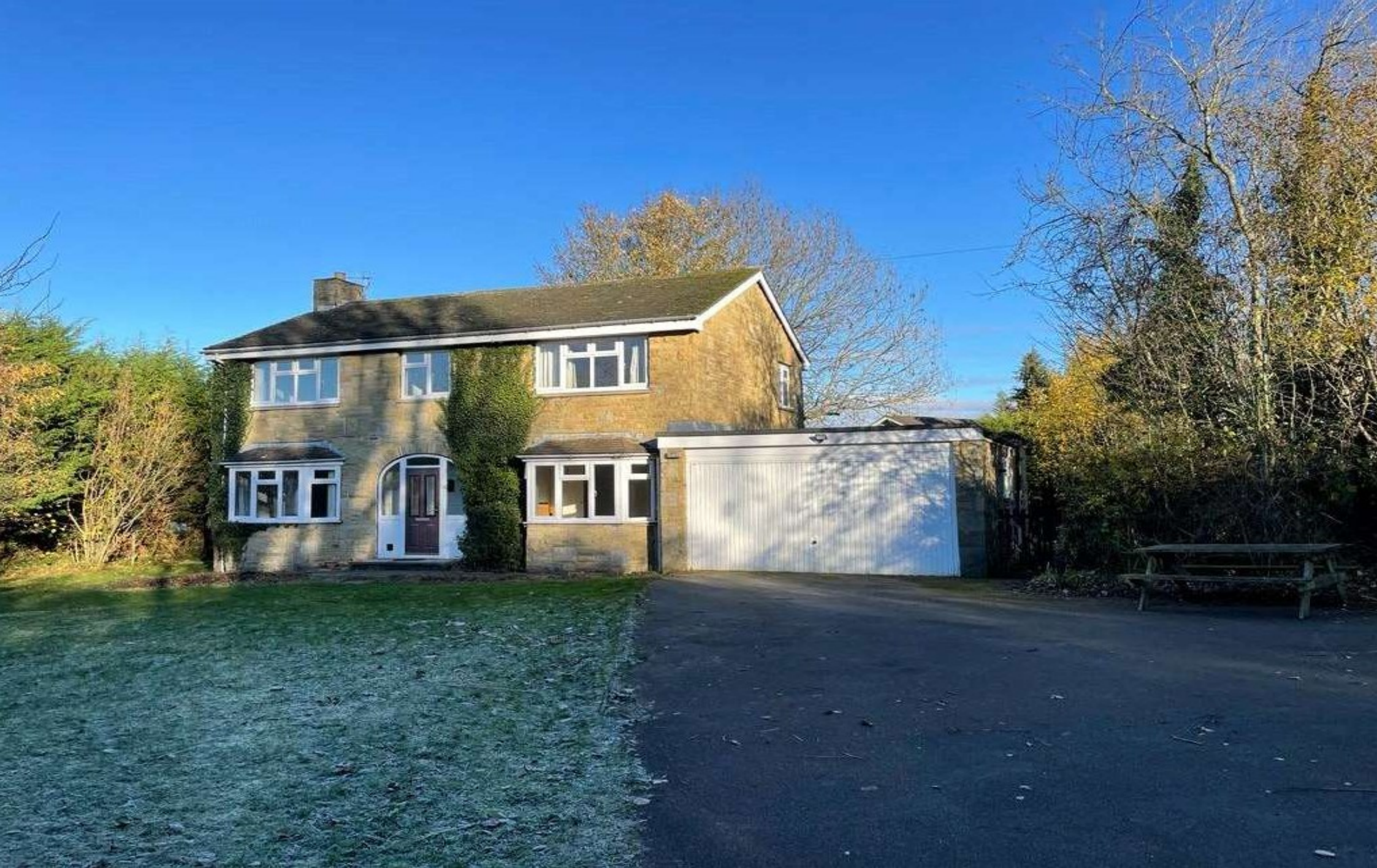
THE VICARAGE, OLD POOL BANK, POOL IN WHARFEDALE, LS21 1EJ £1,700 per month