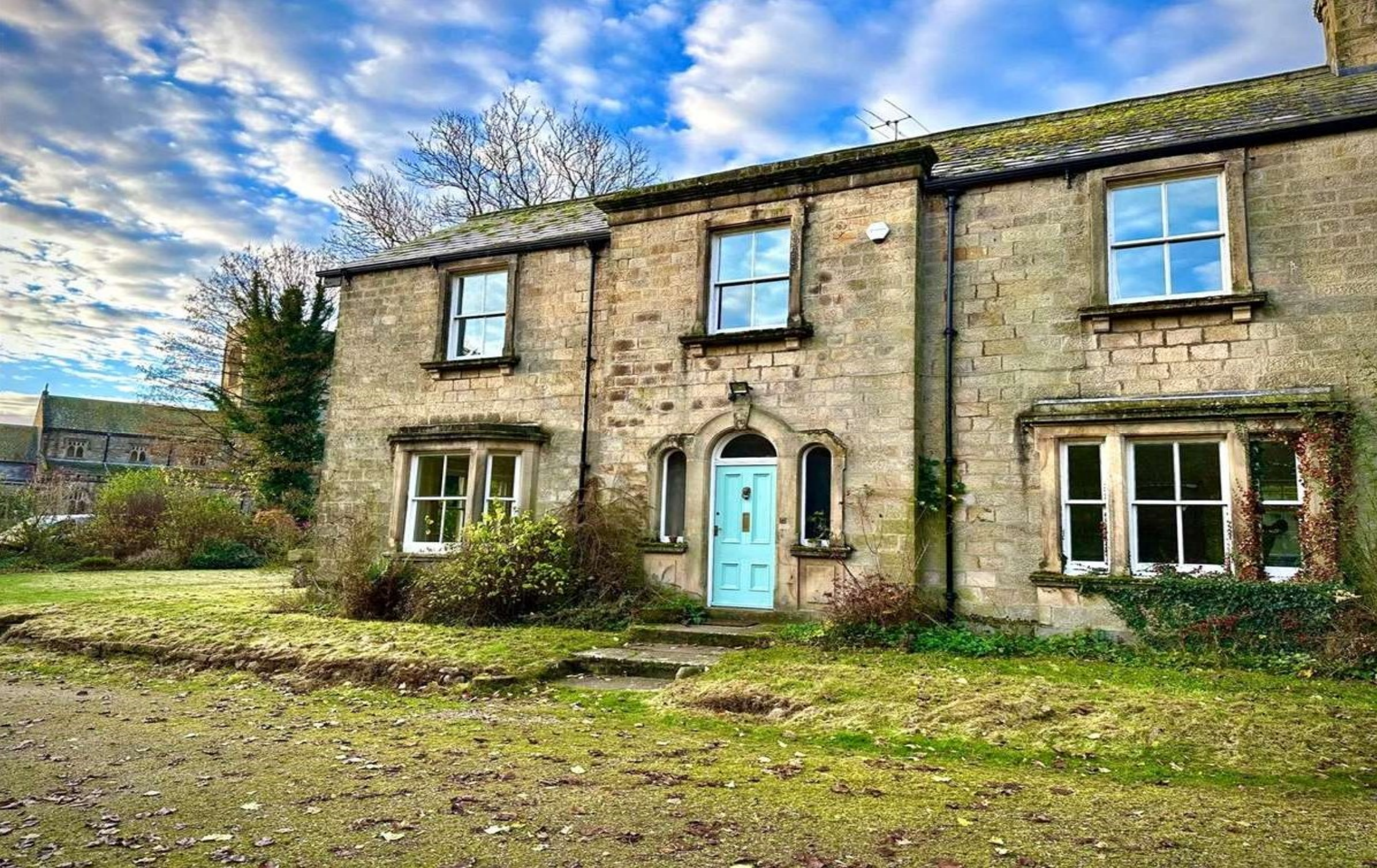
THE RECTORY, MAIN STREET, BURNSALL, SKIPTON, NORTH YORKSHIRE, BD23 6BP £1,700 per month