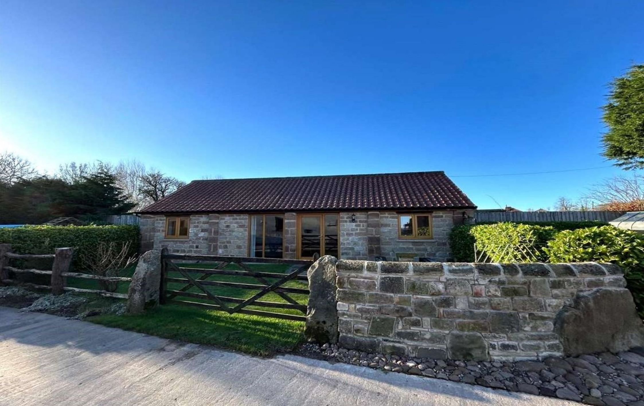
THE CARTSHED, THISTLE HILL FARM, THISTLE HILL, KNARESBOROUGH, HG5 8LS £1,400 per month