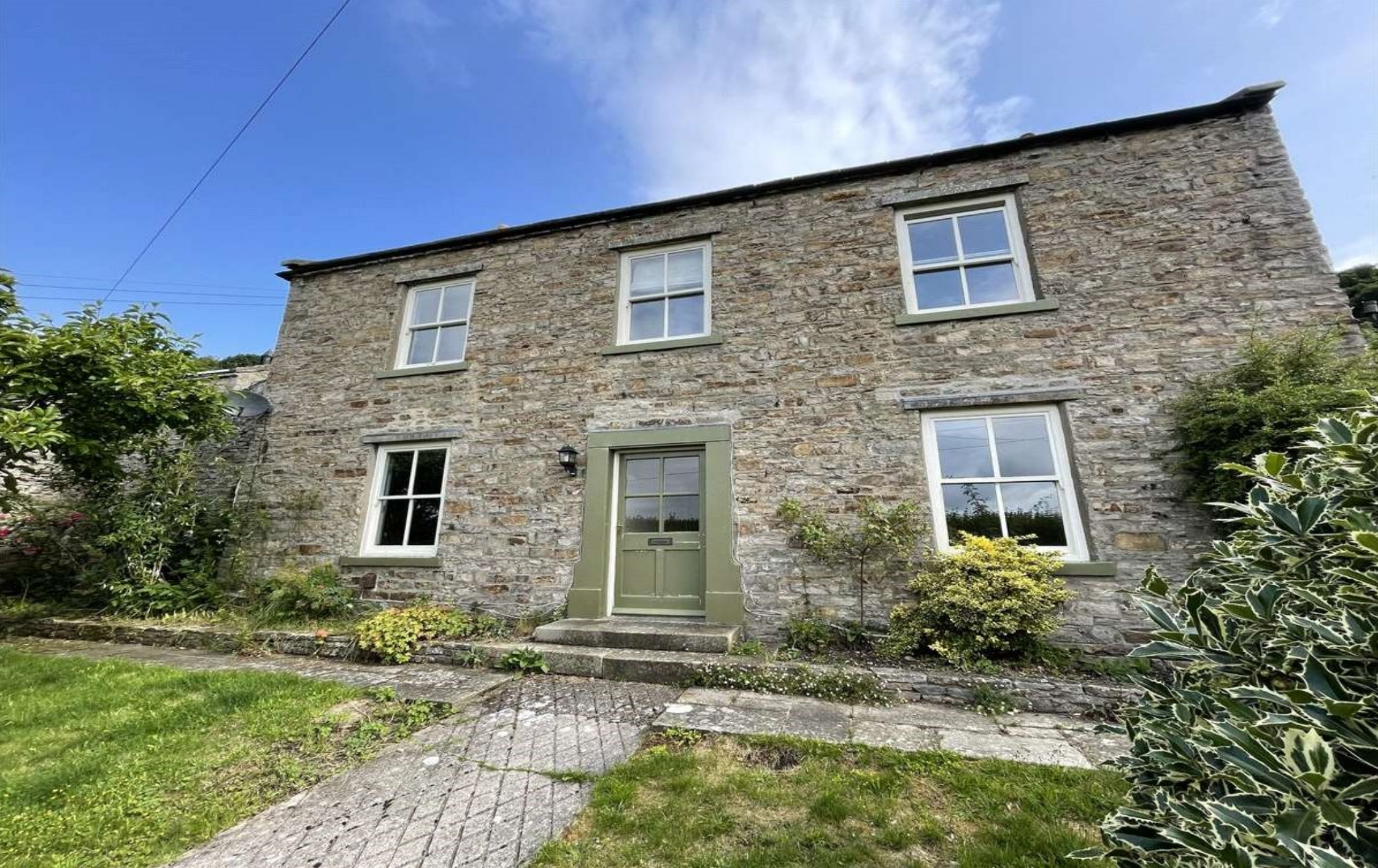
PRESTON MOOR FARMHOUSE, PRESTON UNDER SCAR, LEYBURN, DL8 4AJ £1,975 per month