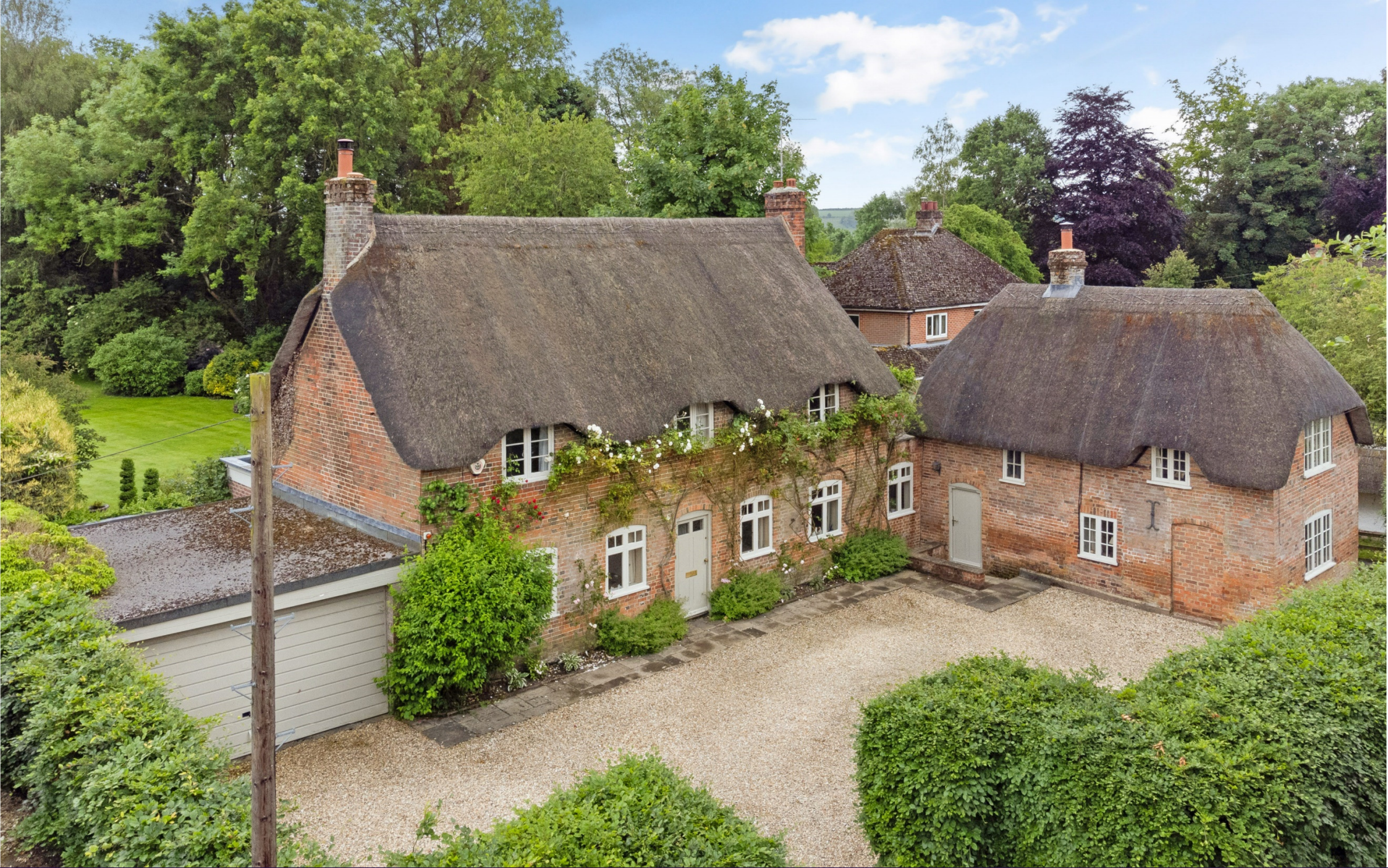
CHEQUERS HOUSE, MARDEN