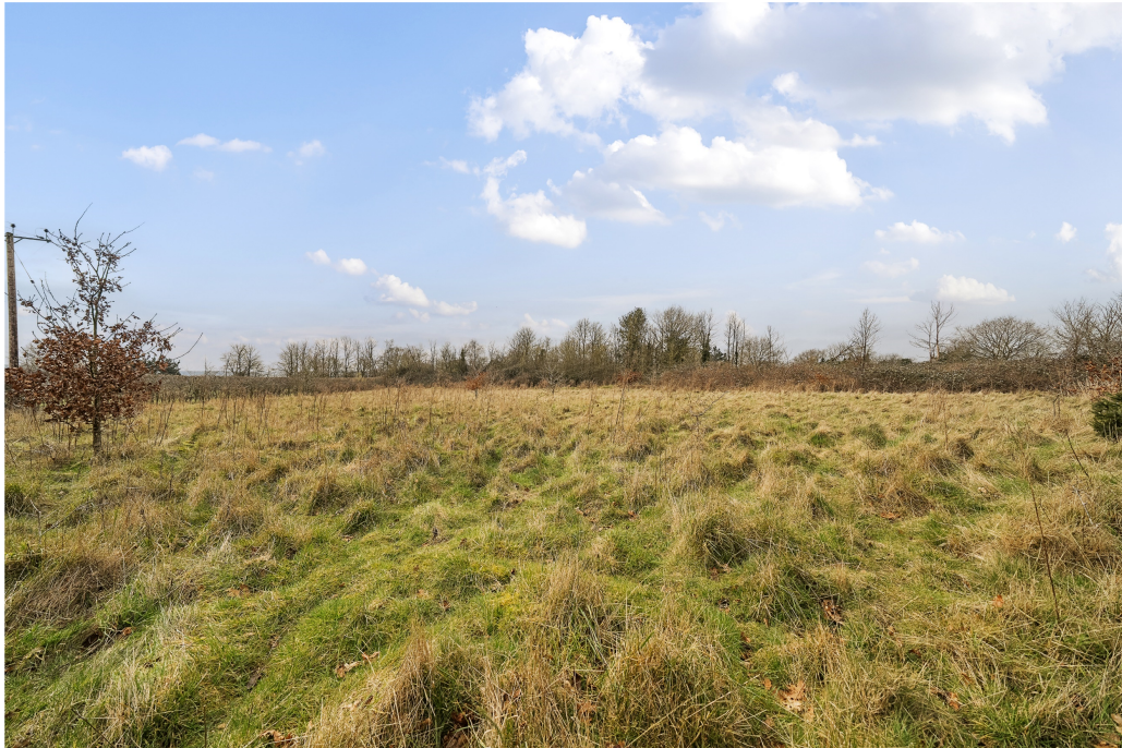
Classification L2 - Business Data