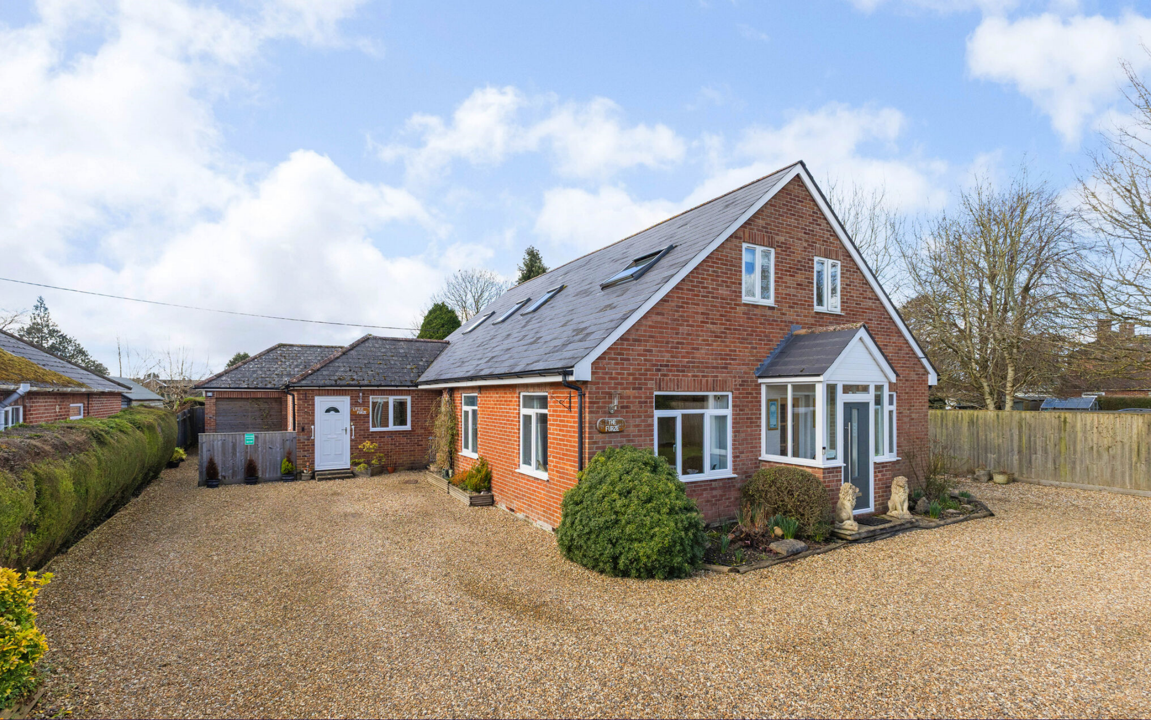
THE FURZE, NORTH NEWNTON, PEWSEY