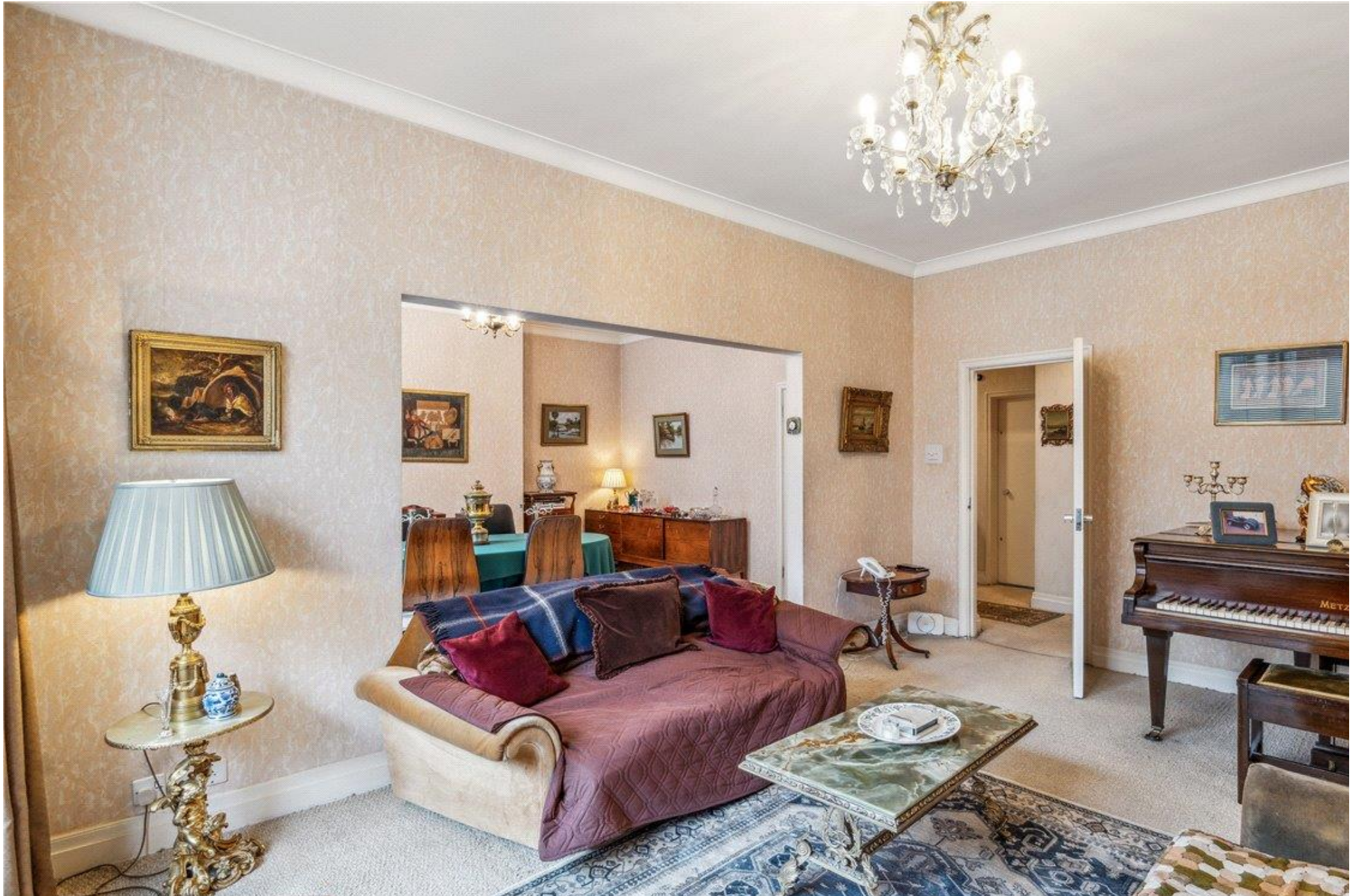
Classification L2 - Business Data