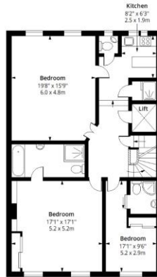
Third Floor Floor Area 1206 Sq Ft - 112.04 Sq M