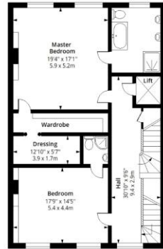
Second Floor Floor Area 1212 Sq Ft - 112.59 Sq M