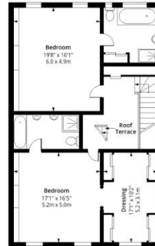
Fourth Floor Floor Area 1215 Sq Ft - 112.87 Sq M