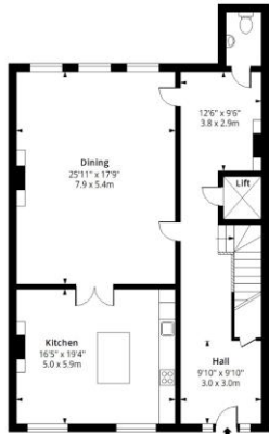
Ground Floor Floor Area 1337 Sq Ft - 124.21 Sq M