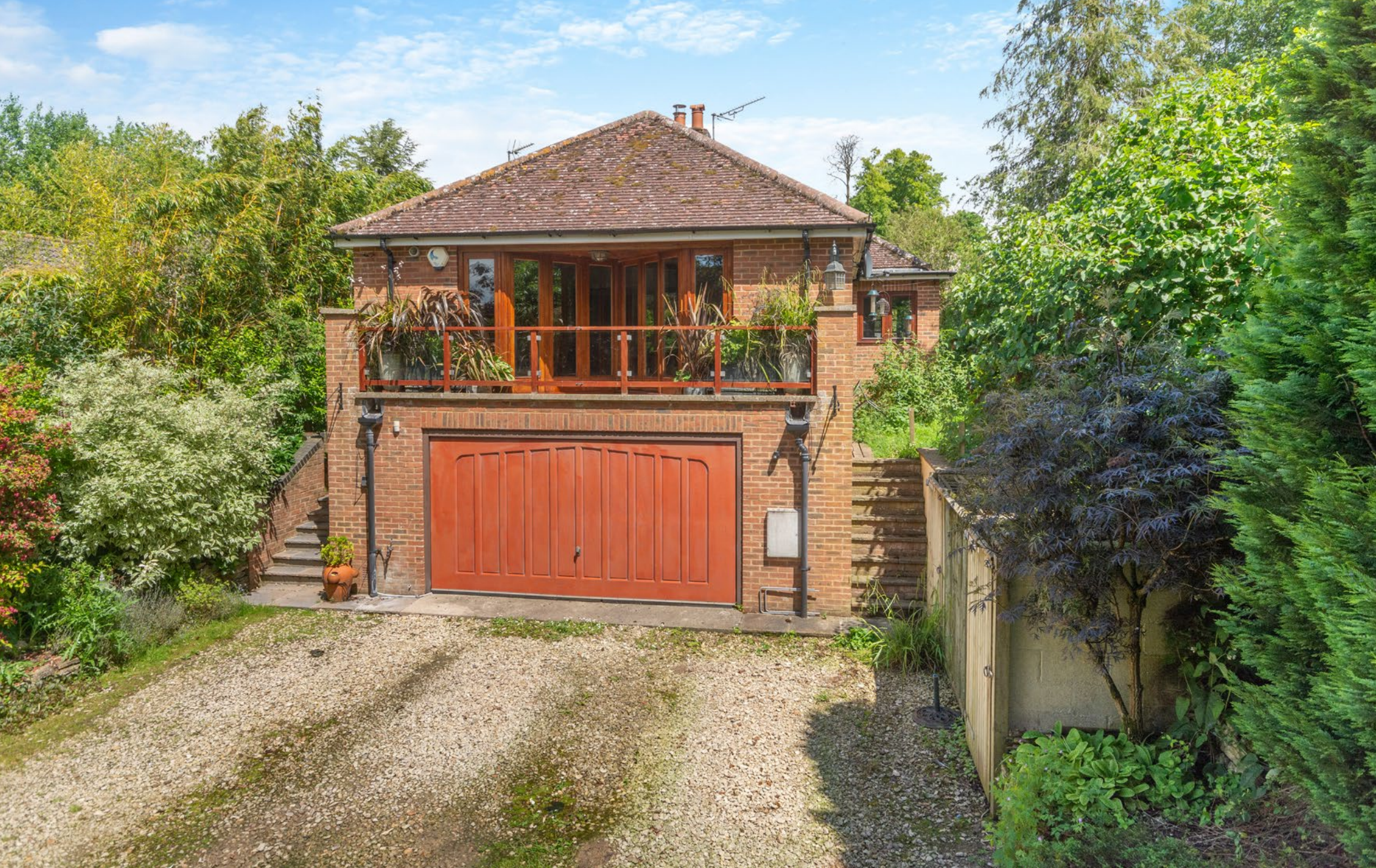
WOODRIDGE, 1A THE MALTINGS Guide Price £625,000