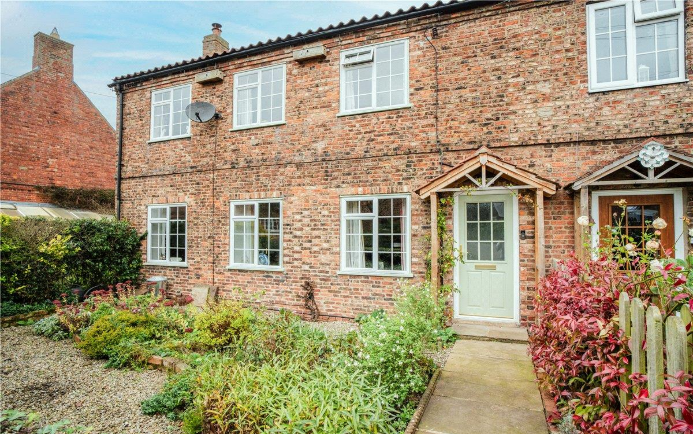
FORGE COTTAGE, MAIN STREET, LINTON ON OUSE £790,000