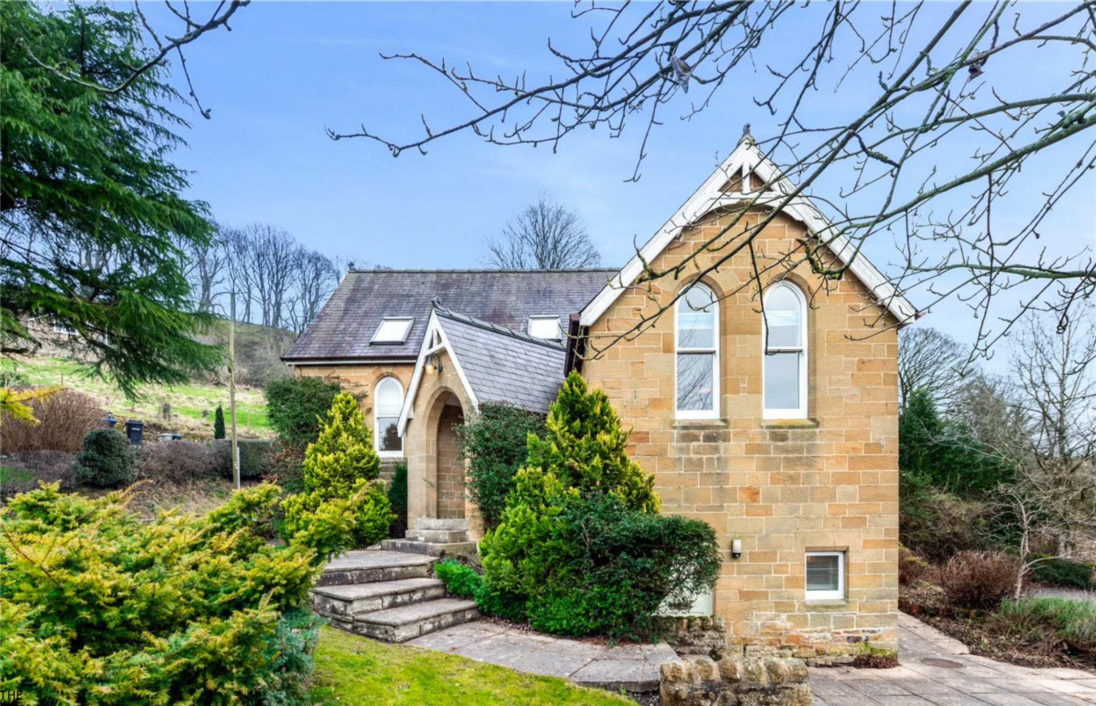
THE OLD CHAPEL, BOLTBY £650,000