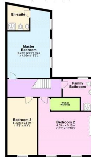
First Floor Approx. 84.1 sq. metres (905.4 sq. feet)