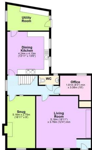
Total area: approx. 220.5 sq. metres (2373.9 sq. feet)