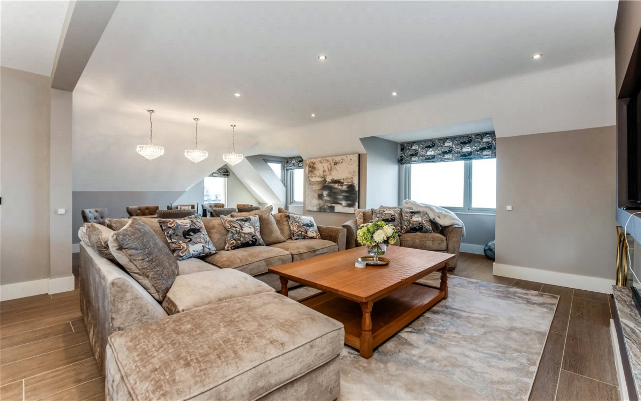
COOTS NEST, FARNE HOUSE £1,000,000