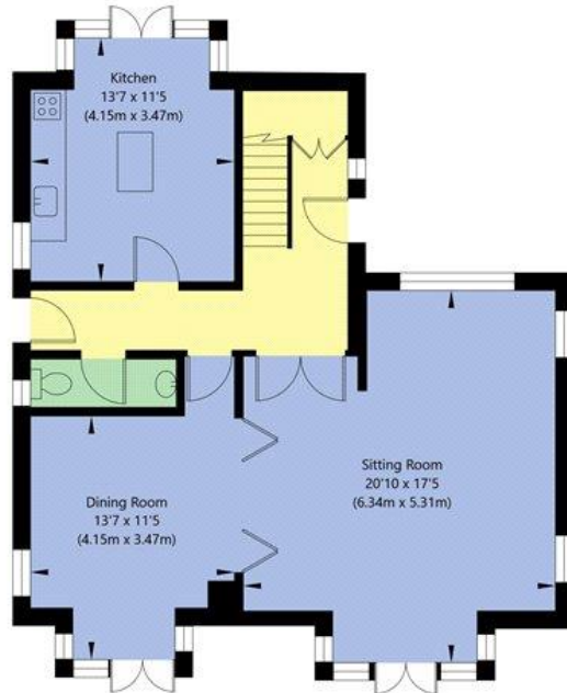
Ground Floor GROSS INTERNAL FLOOR AREA APPROX. 783 SQ FT / 72.74 SQ M