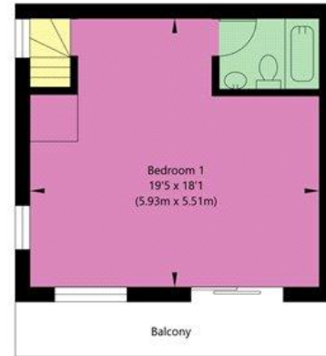
Cottage First Floor GROSS INTERNAL FLOOR AREA APPROX. 352 SQ FT / 32.67 SQ M