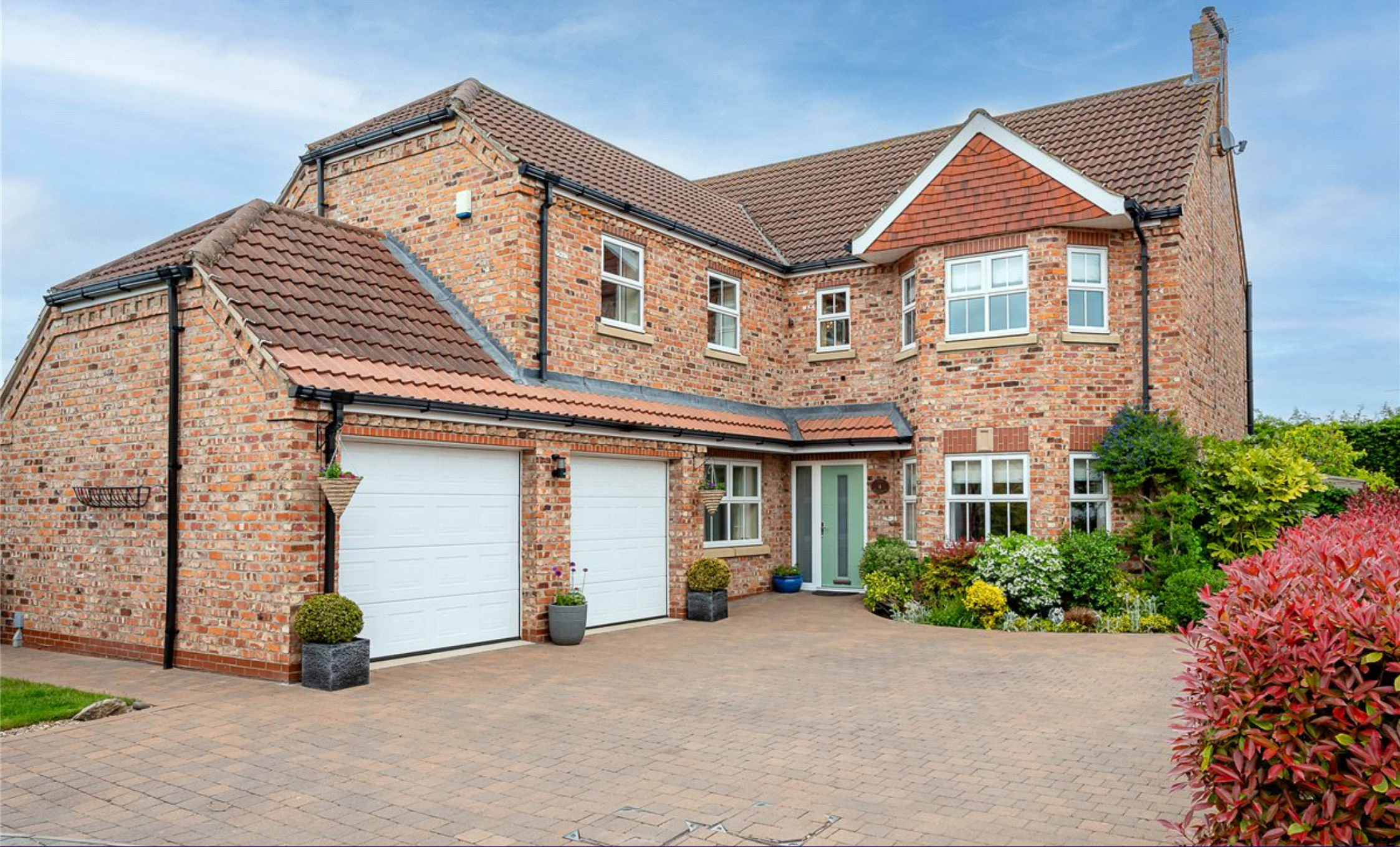
THE HOLLIES, STOCKTON ON THE FOREST £895,000