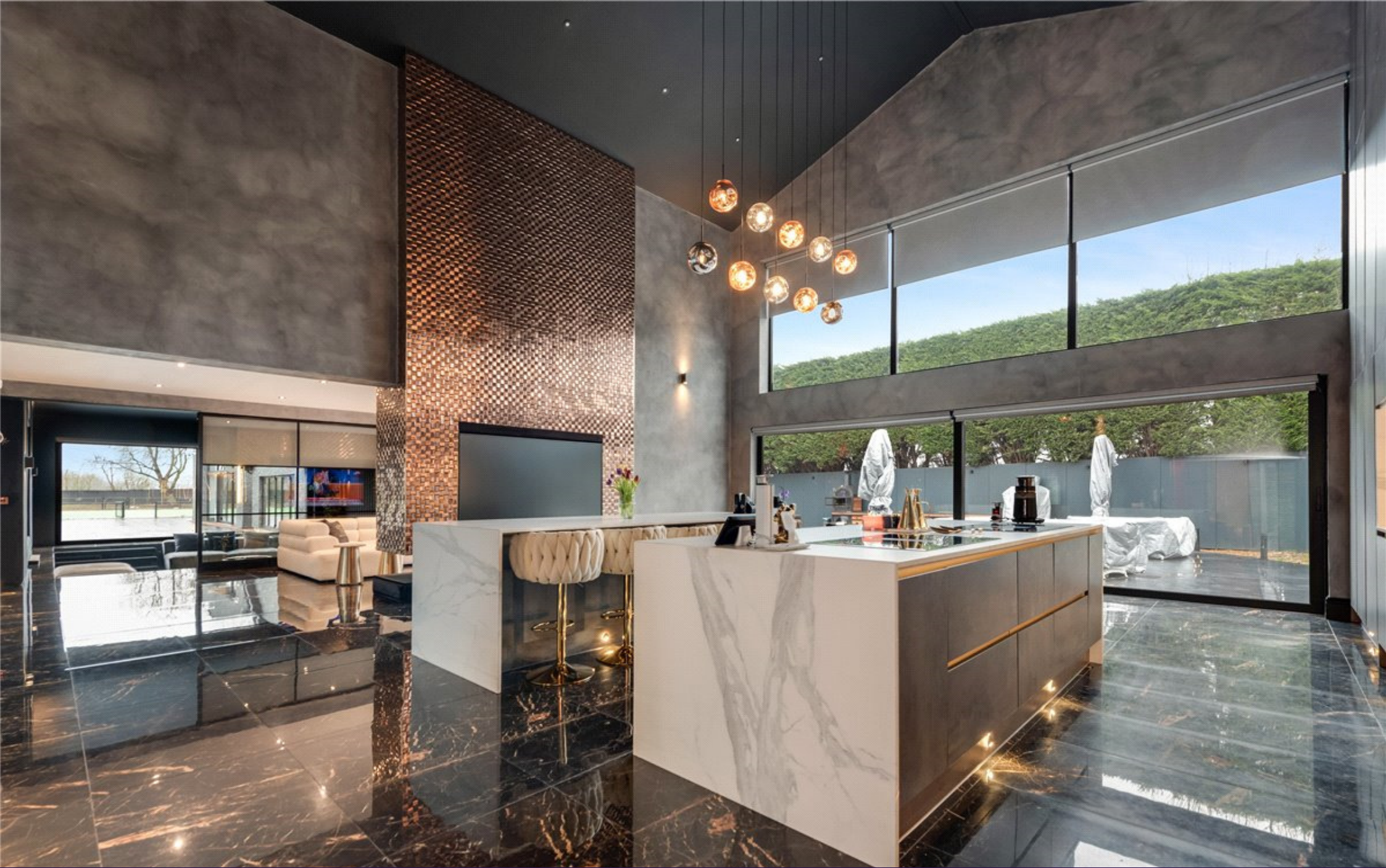
TELLI MANSION, TUDWORTH ROAD, HATFIELD