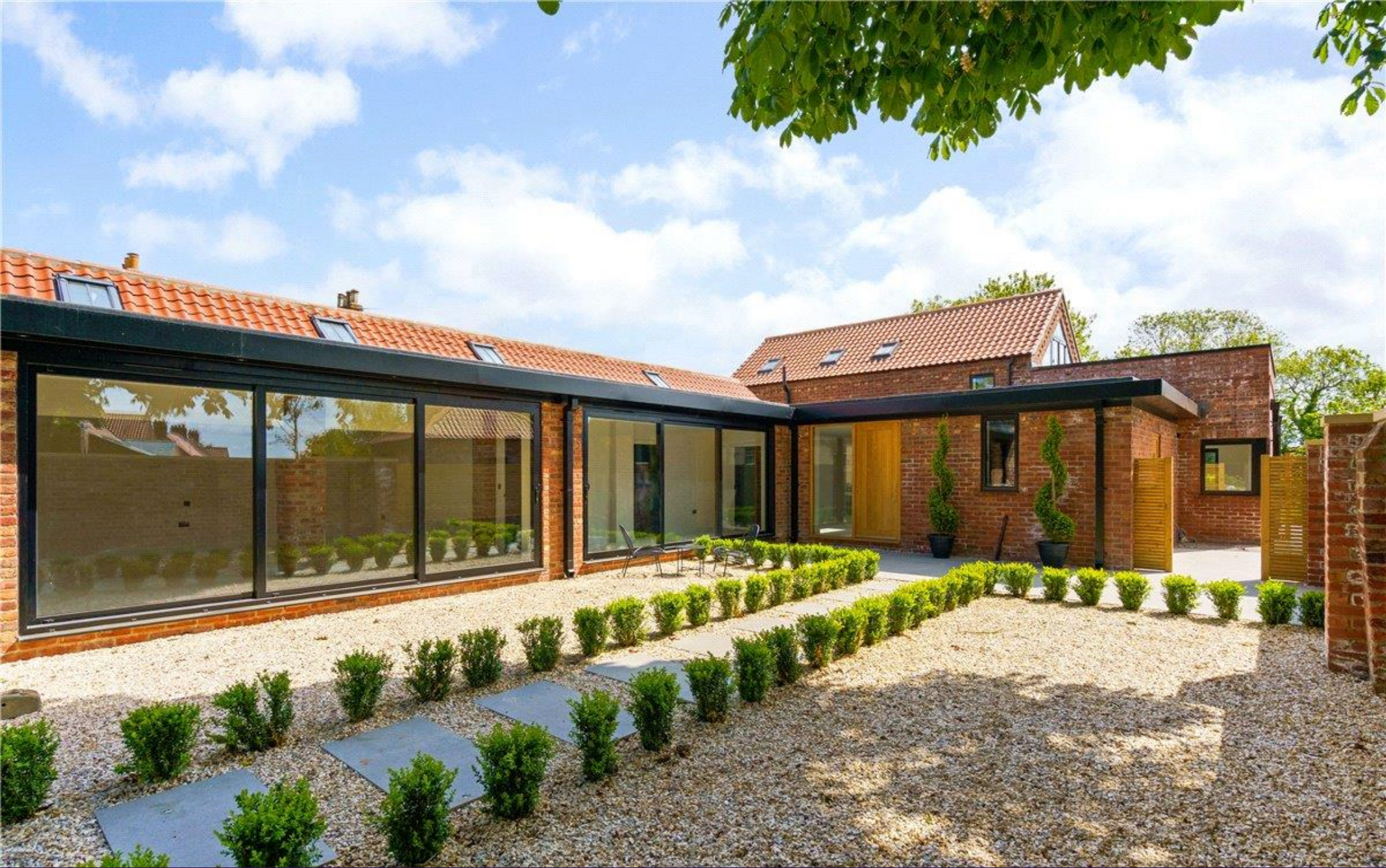
THE COACH HOUSE, NORTH DALTON £975,000