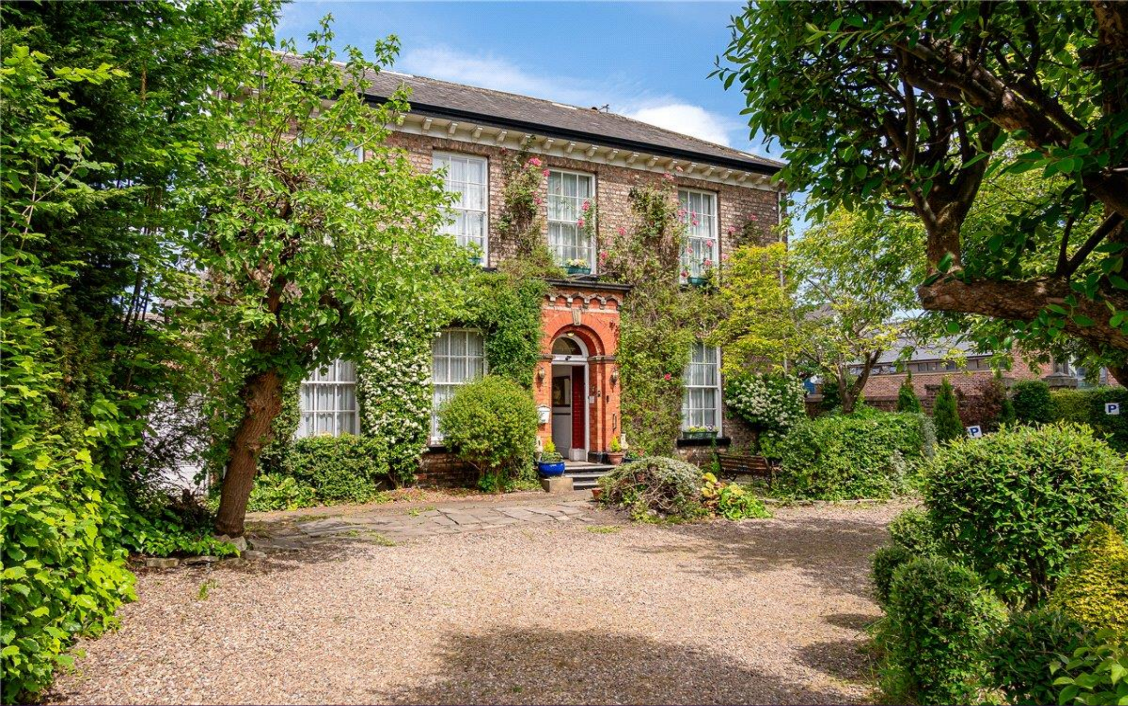
HOLLY LODGE, FULFORD ROAD £900,000