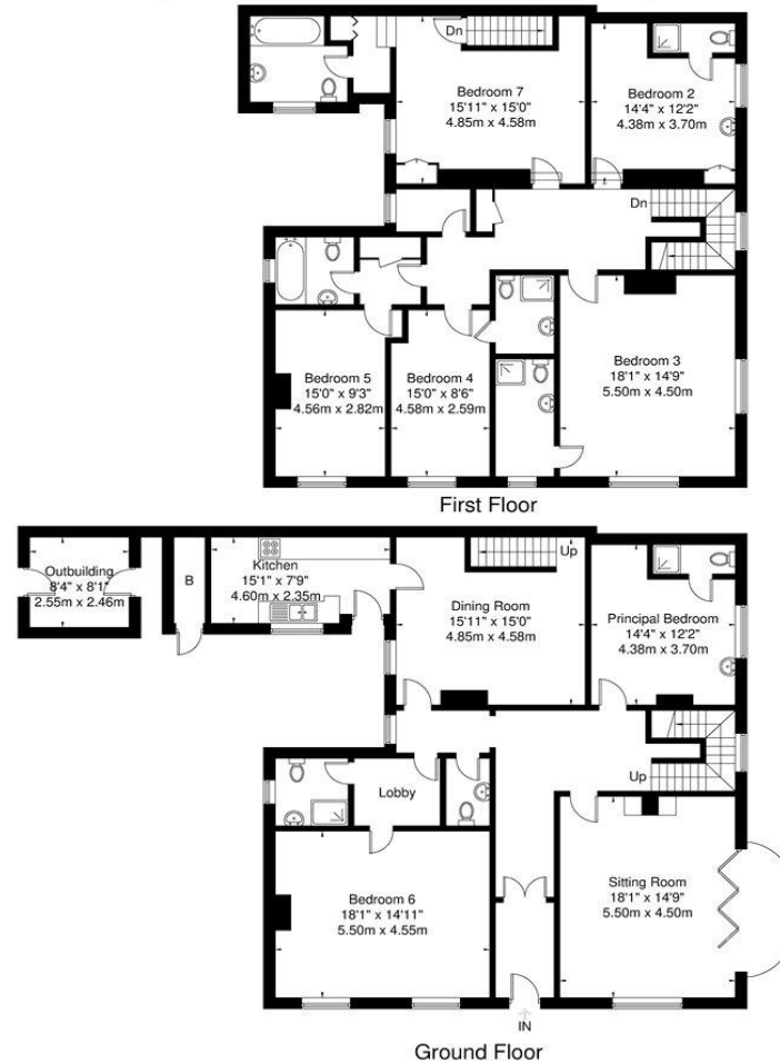
ILLUSTRATION FOR IDENTIFICATION PURPOSES ONLY ALL MEASUREMENT ARE MAXIMUM, AND INCLUDE WINDOW BAYS AND WARDROBES WHERE APPLICABLE THIS PLAN MUST NOT BE REPRODUCED BY ANY OTHER PERSON WITHOUT PERMISSION

Approximate Gross Internal Area = 281.1 sq m / 3036 sq ft