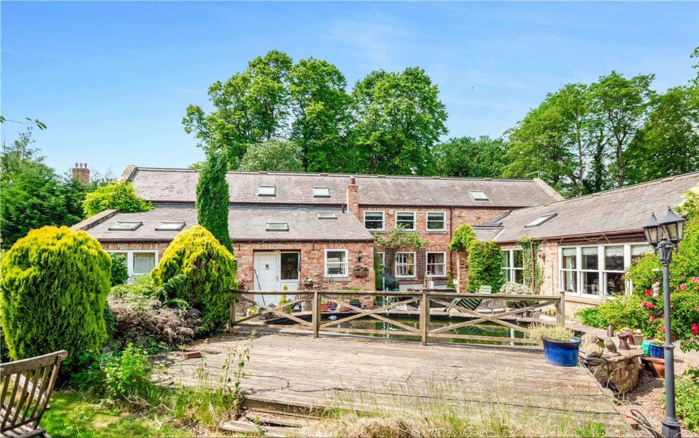
THE HALL LODGE, SCHOOL ROAD, HEMINGBROUGH £750,000